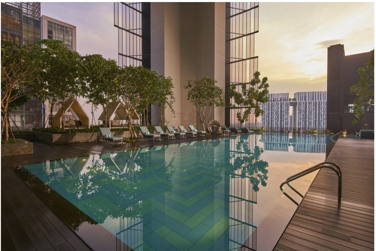
Infinity pool in the Club aea