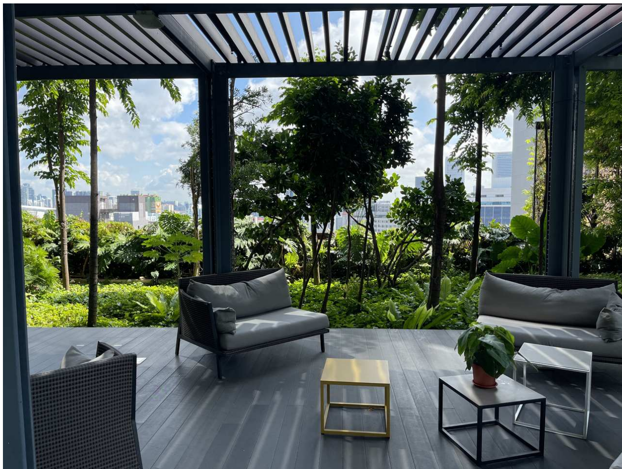
Reception sky garden

Checking into the hotel is in the open air on one side of a sky garden on the twelfth-floor reception, the lower floors being offices. The nine floors above contain the superior and deluxe rooms and the four floors above them the club rooms. The club rooms will have their own reception on the 20 th floor as staffing levels increase.