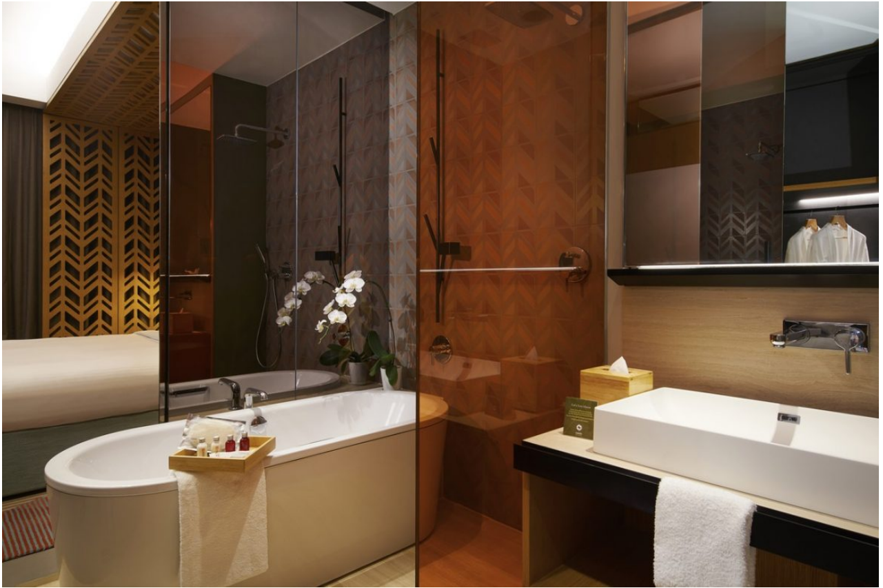
Free standing bath