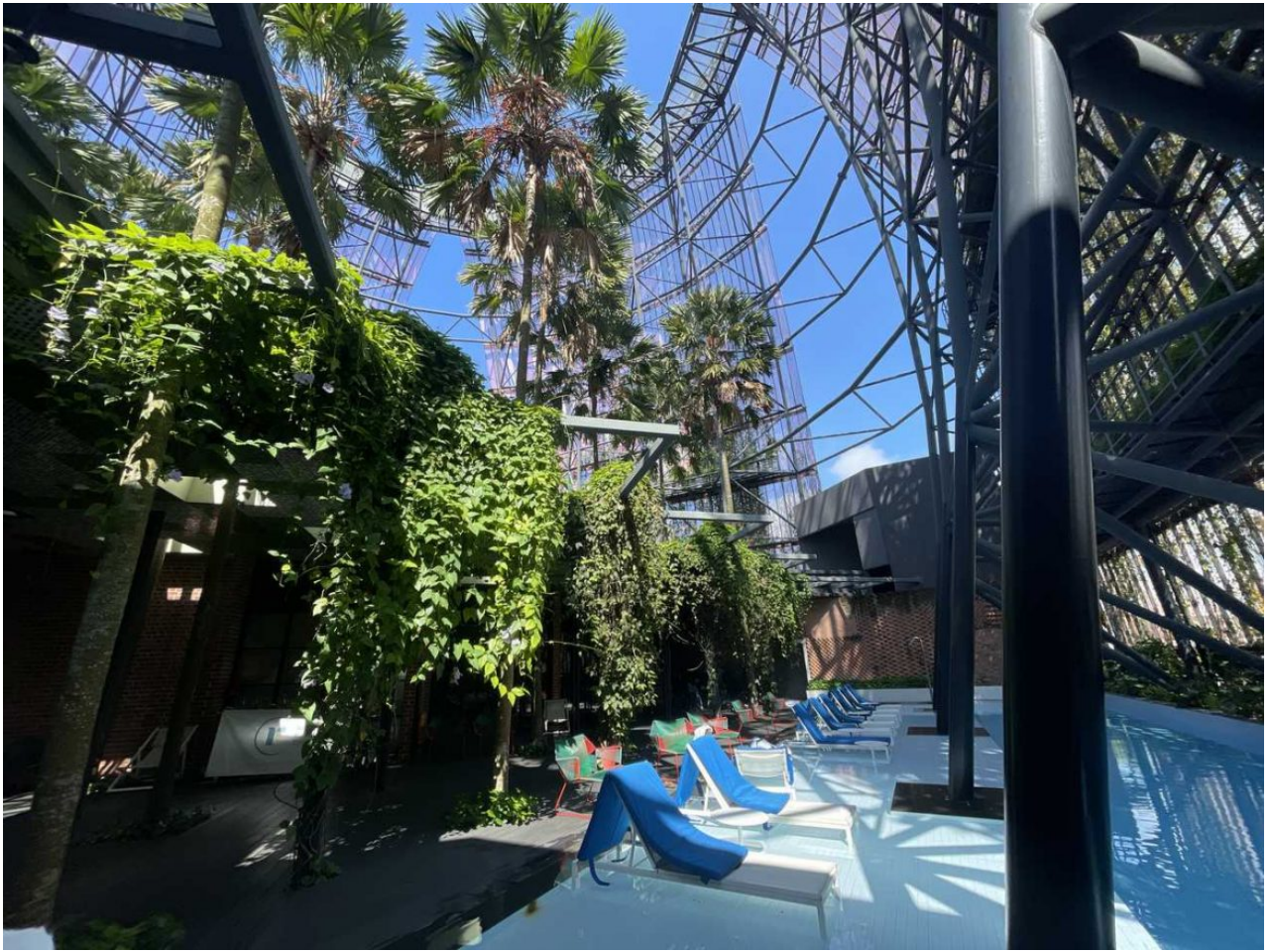
Roof top pool with no roof