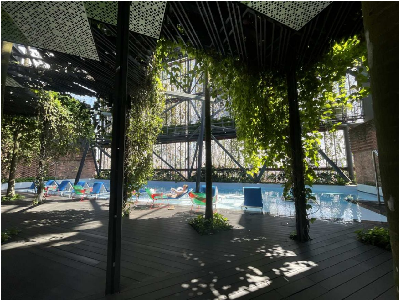
Roof top pool